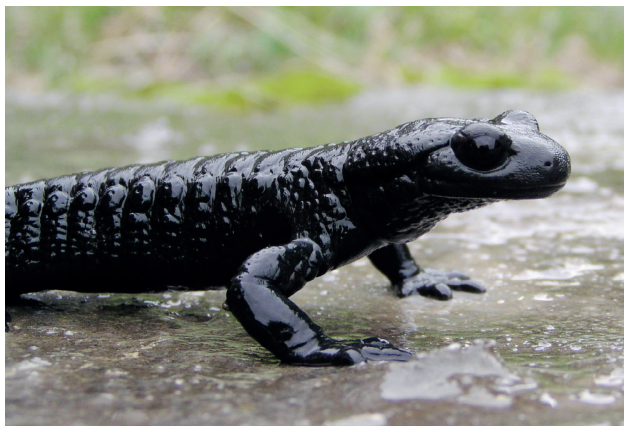
Figure 1. Alpine salamander from the Hinterstein Valley, Bavarian Alps, Germany (not collected).

ropean species and populations unaffected. Here, we report the results of a study on Bd infection in the viviparous and entirely terrestrial Alpine salamander, Salamandra atra LAURENTI, 1768 (Fig. 1). This caudate is endemic to the Alps and the Dinaric Alps (GRIFFITHS 1996).