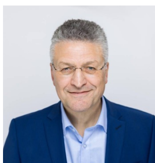
Prof. Dr. Lothar H. Wieler