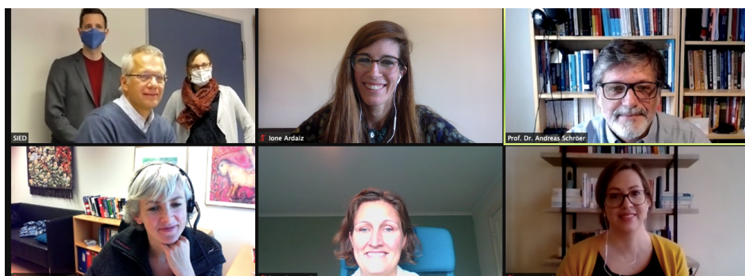
Transnational project meeting, October 2020

The initial elements that form the platforms will be in focus: social brokerage, deep listening, digital and co-creation process. Each of the Open Innovation Platform components will be presented according to what they are, examples on how ALC has implemented them and followed by hands-on activities to explore them in the context of the challenge the participants will be focusing on.