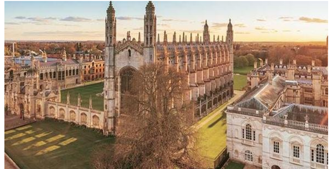
Top 10 Universities in the UK

According to the QS World University Rankings 2022