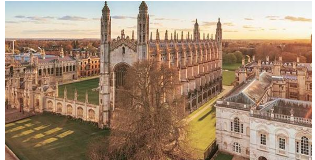
Top 10 Universities in the UK

According to the QS World University Rankings 2022