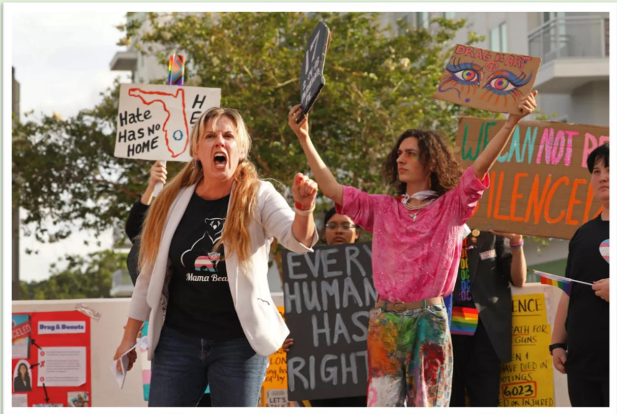
Protest during Orange County, Florida School Board Meeting (11 April 2023)

(LGBTQ+ student, living near Pulse, a gay nightclub in Orlando, where a gunman killed 49 people in 2016)