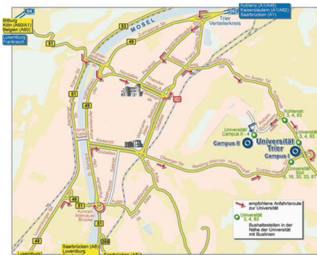
Directions to Campus I