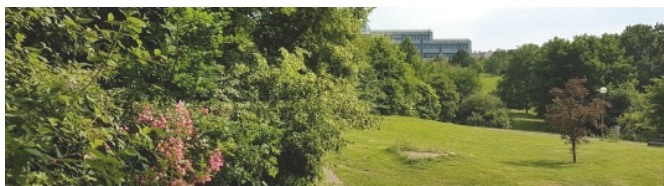
A view of the University's green campus.

The scenic Moselle wine country surrounding Trier offers further cultural treasures, outdoor activities, and wine tasting. It has been named one of its 52 places to go in 2016 by the New York Times.