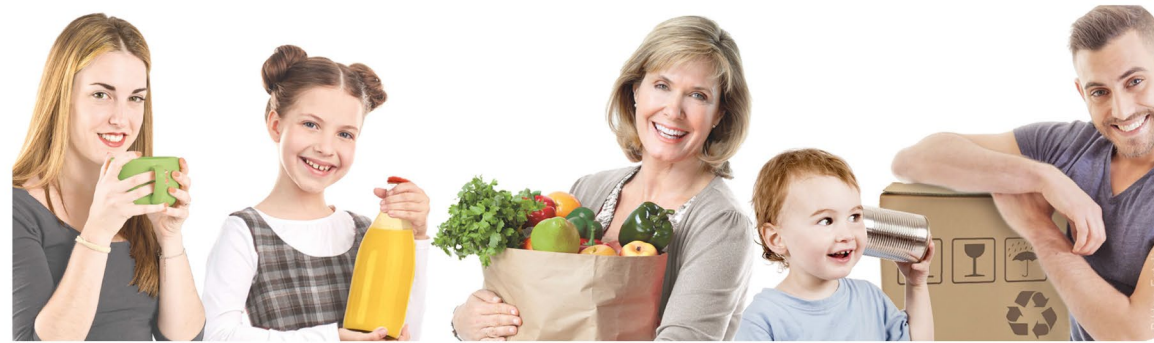
Separate waste – show responsibility Trier les déchets – se montrer responsable