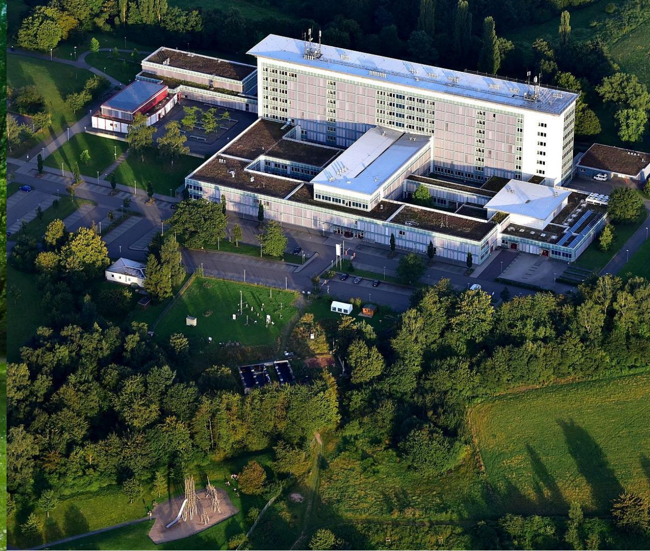
Campus I und Campus II